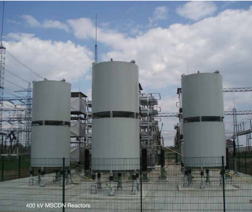
400 kV MSCDN Reactors