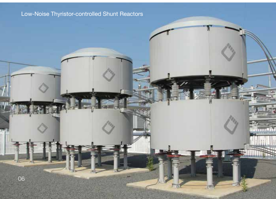
Low-Noise Thyristor-controlled Shunt Reactors

Sound requirements have become increasingly stringent as substations and residential areas encroach upon each other. In 2008, Coil Innovation introduced its patented low-noise air-core reactors to the market place. Since then, many of Coil Innovation's low-noise reactors have been supplied to installations around the world.