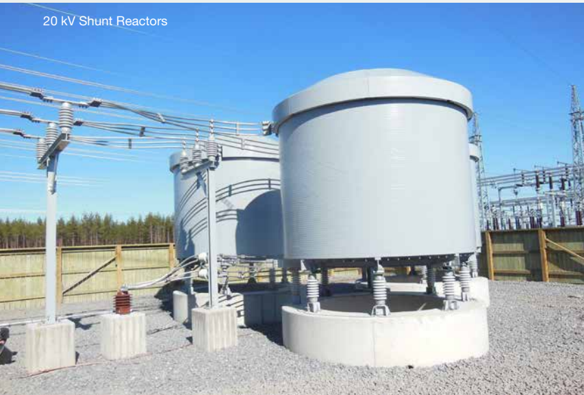
20 kV Shunt Reactors