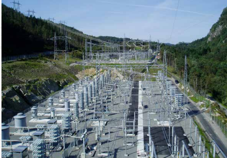
AC Filter Yard of an HVDC Converter Station

Smoothing reactors reduce the ripple current magnitude that is present in a DC system.