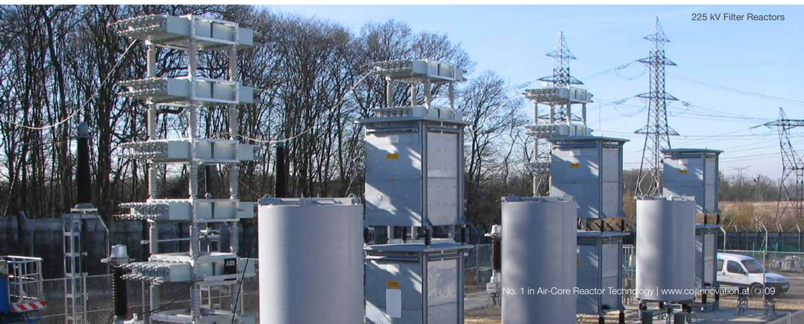
225 kV Filter Reactors

Harmonic filter reactors are used in combination with capacitors and resistors to form filter circuits that reduce the harmonic content in power systems. The Company's capacitor damping or inrush current limiting reactors are installed in series with the capacitor bank, while its discharge reactors are connected to the bypass circuit.